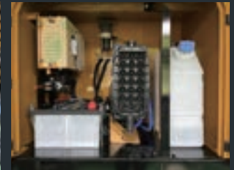
Centralized auxiliary equipment